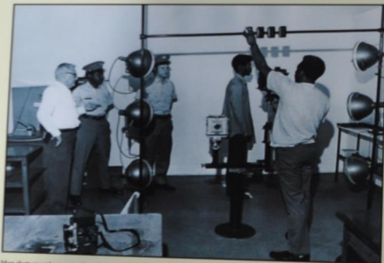
Mug shots must be consistently updated to be useful for identification. Above: Eastern State mug shot photography, c. 1905.

Identifying prisoners has always been challenging. In the early 1800s, officials recorded physical characteristics of incoming prisoners, and even the inmates' habits, such as drinking alcohol. These records could be used to identify repeat offenders and to track escaped prisoners.